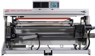
DuPont™ Cyrel® Microflex 1700

DuPont Advanced Printing brings together leading technologies and products for the printing and package printing industries. DuPont™ Cyrel® is one of the world's leading flexographic platemaking systems in digital and conventional formats, including DuPont™ Cyrel® brand photopolymer plates ( analogue and digital ), Cyrel® platemaking equipment , Cyrel® round sleeves , Cyrel® plate mounting systems and the revolutionary Cyrel® FAST thermal system .